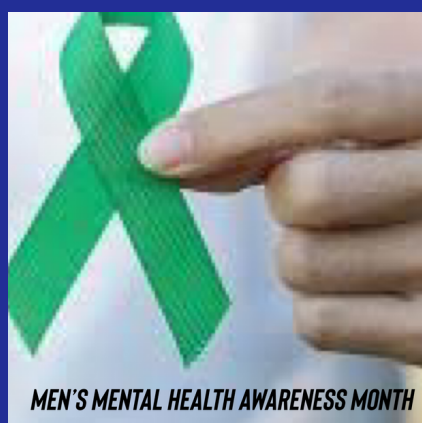
MEN'S MENTAL HEALTH AWARENESS MONTH