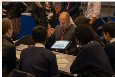
CAREERS READY DAY!